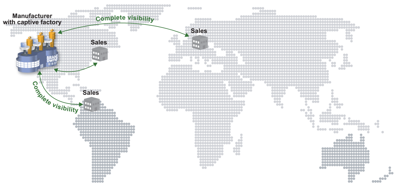
Figure 1: Yesterday's linear supply chain provided complete visibility

This persistent shift to overseas manufacturing has especially affected the production of consumer electronics. McKinsey Quarterly confirms that “the production of high-tech goods has moved steadily from the United States to Asia over the past decade.” 2